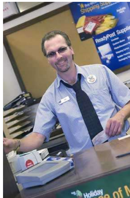
This photograph is available for purchase from the J. Love Gallery in Dexter.